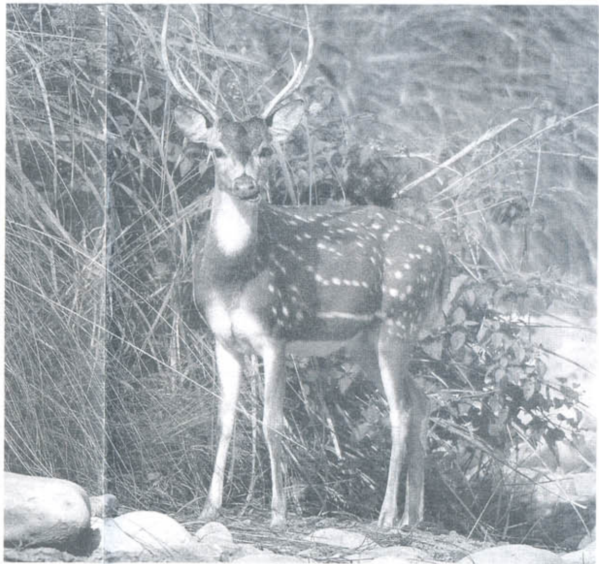
Deer oh deer: It's easy to find chital, or spotted deer, in the Corbett reserve, just not tigers.

The park itself is named for Jim Corbett, author of the best-selling Man-Eaters of Kumaon , who became a larger-than-life figure in the Himalayan hill country before World War II and Indian independence. The British hunter tracked down and killed 50 tigers and more than 250 leopards, which had terrorised local villagers, but believed that a taste for human flesh was developed only by ageing or wounded tigers. His concern for the tiger's survival led to the establishment of the reservation.