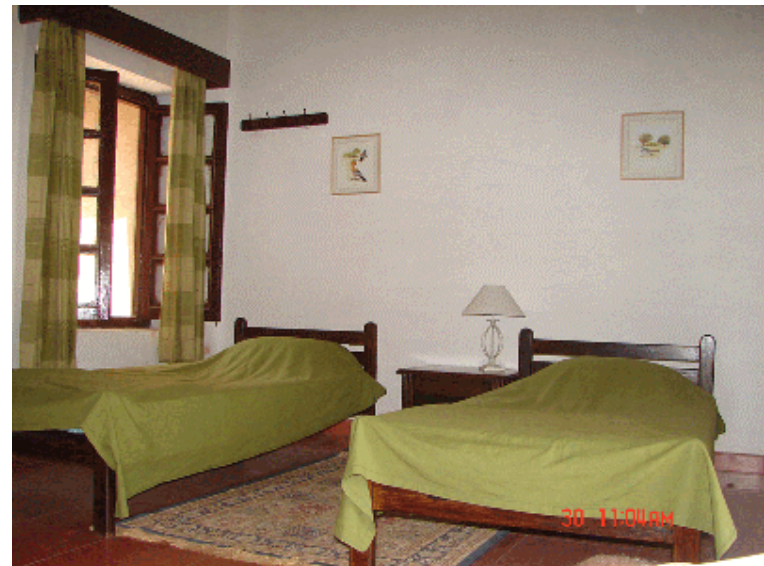
Photo: Rooms at Dhikala forest rest house

The Dhikala complex is the largest visitor accommodation facility inside the Corbett Tiger Reserve. Dhikala has been renovated in 2006 and has clean accommodation with attached facilities. A multi-cuisine vegetarian restaurant, well-stocked library and forest department's riding elephants that make it the preferred stop for wildlife enthusiasts and photographers. Wildlife documentaries are featured every evening under a thatch at the campus