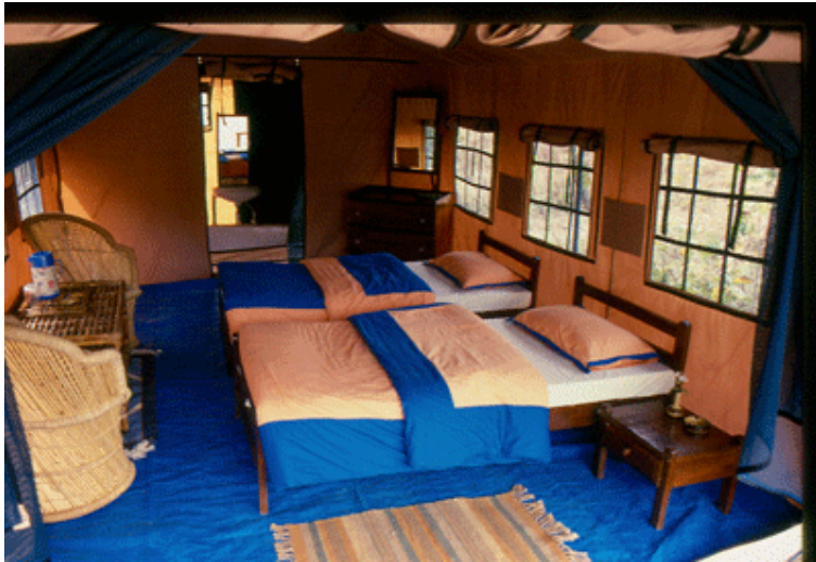
Photo: Fixed camp at Corbett

Situated in the village of Bhakrakot, north- eastern periphery of Corbett Tiger Reserve. Camp is surrounded by mixed deciduous forests that are extremely rich in wildlife and bird-life. Spacious safari tents on raised wooden floors are well spaced for privacy. Each tent has a deck and a fully functional toilet.